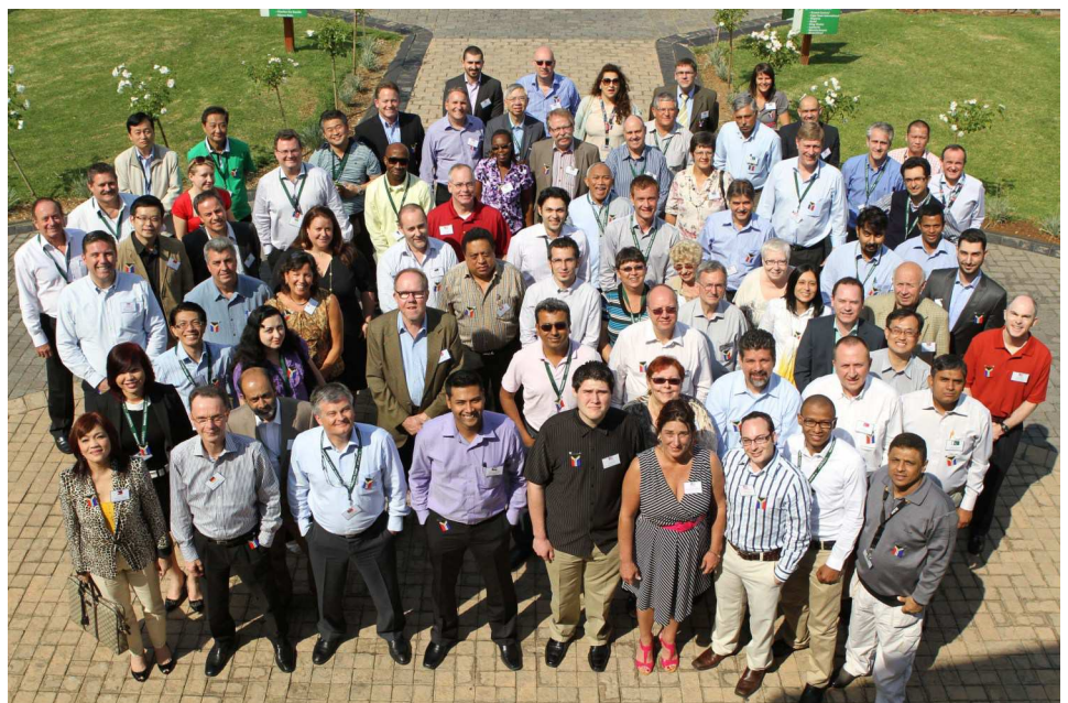
AGM 2012 Group Photo, Johannesburg, South Africa

We would like to renew our thanks and gratitude to Kingfisher Freight Services for their hospitality and gracious organization of the 2012 AGM.