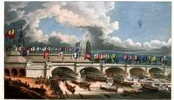
London Bridge across the Thames River on its first opening day, 1 August 1831.